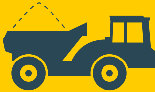
Conventional compact tipper