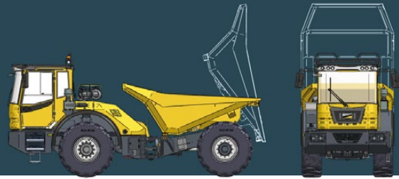
C815s Rear tip dumper