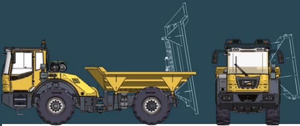
C815s Three-way dumper

What designs do you have in mind for your Bergmann?