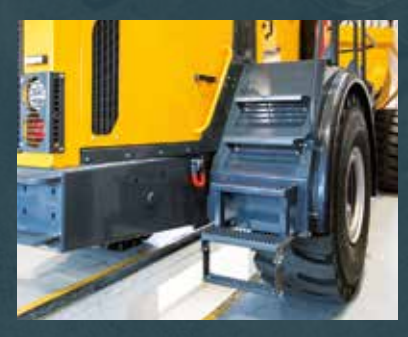
Safe ascent and descent outside of the danger zones and within the driver's field of vision.