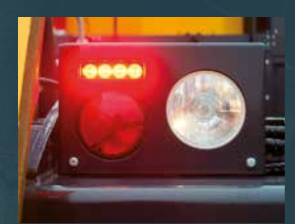
Rear flashing lights supplement the audible warning signals for the safety of those inside and outside the cab.