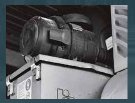
Protective ventilation systems for workplace protection in dusty environments.