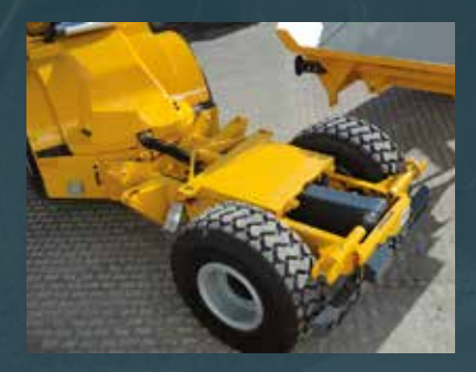
Carrier vehicles are prepared ex works depending on our customers' individual transport needs.